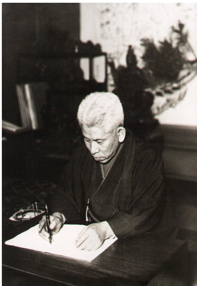
(From the book Teachings of Meishu-Sama - Vol. 2 Pg. 4)

Iyeyasu Tokugawa, a famous Japanese Shogunate feudal lord whose descendants ruled for three hundred years, was famous for his patience. He would never begin any project before the time was right. This is beyond doubt the reason the government he stablished lasted so long. A poem was written to describe his character: "If the cuckoo does not sing, I will wait until it does." Tokugawa understood the vital importance of timing, Even God waits for the right time. If you keep this mind you will succeed at anything you undertake that is worthwhile.